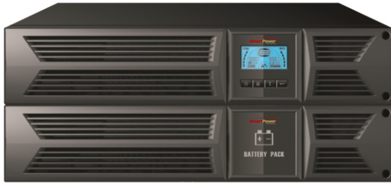
Rack With EBM