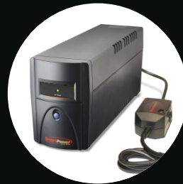
VENUS UPS Line Interactive Uninterruptible Power Supply with Transformer-Based Filter (TBF™)

Battery back-up with our TBF filtering, surge suppressor in addition it also has voltage regulation, UPSwing monitoring software. Also provides Ground Loop Protection.