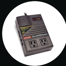
POS GUARDIAN Electronic Power Conditioner Provides Power Protection for Point of Sale (POS) Systems

15-amp product with computer grade filtering, over-voltage and surge protection, network/phone protection. Also provides Ground Loop Protection.