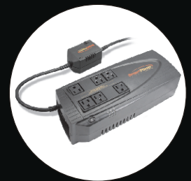
OFFICE-TBF UPS Stand-by Uninterruptible Power Supply for All POS Equipment

Battery backup with Transformer Based Filter, surge suppressor, noise filtration & UPSwing monitoring software. Also provides Ground Loop Protection.