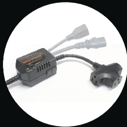
SMART CORD UTBF Computer Grade Filtering for Limited Spaces, Ensures Maximum System Uptime

7 or 10 amp models with computer-grade filtering, numerous receptacle options (1,3 & IEC). Also available with network protection. Also provides Ground Loop Protection.